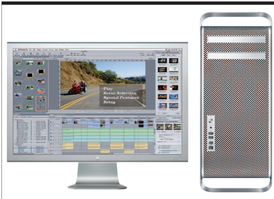
THE FINAL CUT PRO STUDIO 2 SUITE INCLUDES DVD STUDIO PRO FOR AUTHORIZING AND DESIGNING DVDS.

It is the NABC's hope that the FCC will realize the important role that professionally produced VNRs play in the newsroom and cancel the penalties it imposed on Comcast. If that action is taken by the FCC, it will allow TV stations across the country to air segments of VNRs without fear of repercussions. Stay tuned for more updates as this situation evolves.