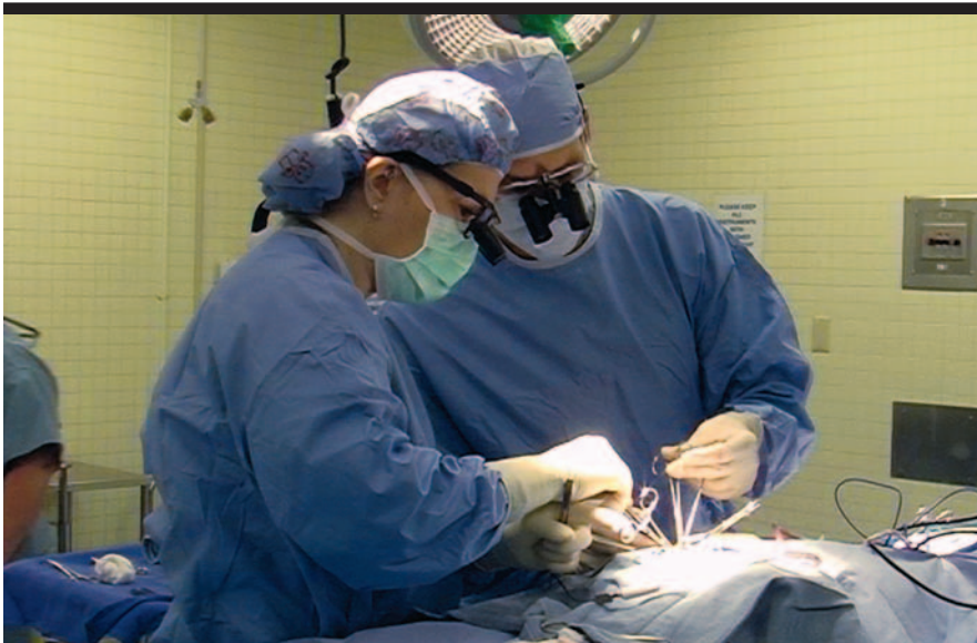
DOCTORS IMPLANT A STRATA VALVE IN AN ADULT PATIENT.

1557 PINE STREET • SAN FRANCISCO, CA 94109 • 415/776-7484 • FAX 415/776-7822 • Visit our Website at: www.gpvideo.com